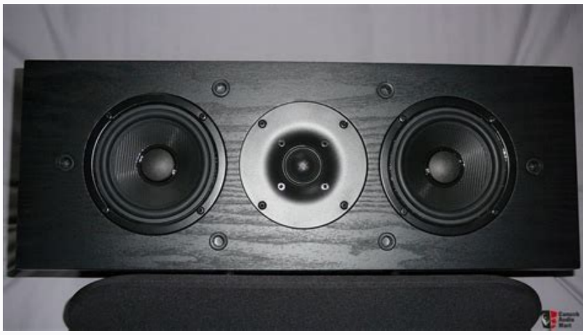
Pioneer sp-c22 dimensions. Pioneer c22 specs. Pioneer center channel speaker sp-c22 review. Pioneer sp-c22 specs.